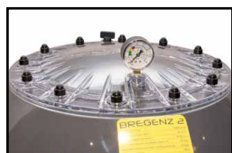
A Ø400 lid in reinforced PP for all models (available also in non-transparent version)