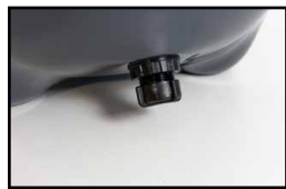
A larger filter drain of 1¼" for faster emptying